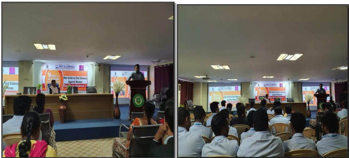
MBA Students during the Session

Our college students spoke on the topic which covered women issues and domestic violence. The programme was concluded with a Vote of Thanks and students felt it was an informative session.